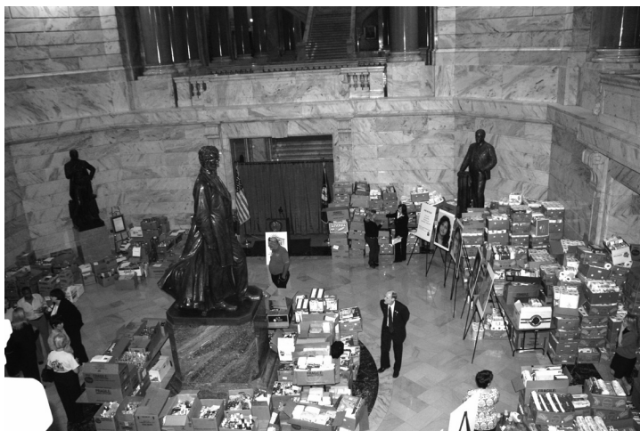
A view of the Capitol Rotunda and some of the many household items donated during last year's Shop and Share.

help support the women and children who are working to restart their lives without violence. Please visit your local Kroger store between 8:00 a.m. and 5:00 p.m. on Saturday, October 24. As you shop, add a few extra items to your cart to donate to Kentucky's shelters. They'll be glad you did.